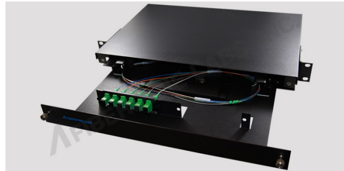
1U High Rack Mount Distribution Center

Termination Box Part Number Build Matrix