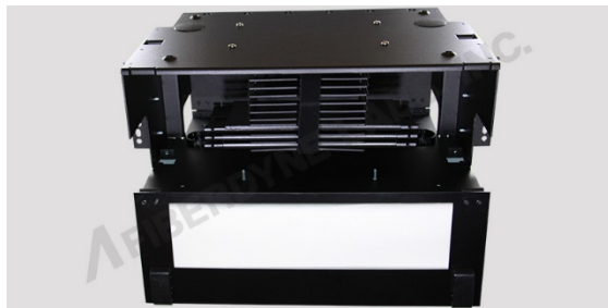
4U Rackmount Splice Housing