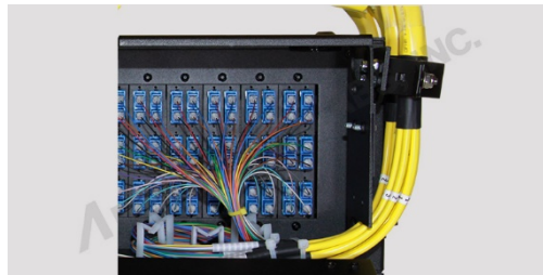
Closeup of Back