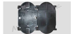
Plastic Splice Tray