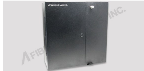
Wallmount Termination Box Closed