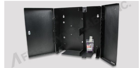
Wallmount Termination Box

Termination Box Part Number Build Matrix